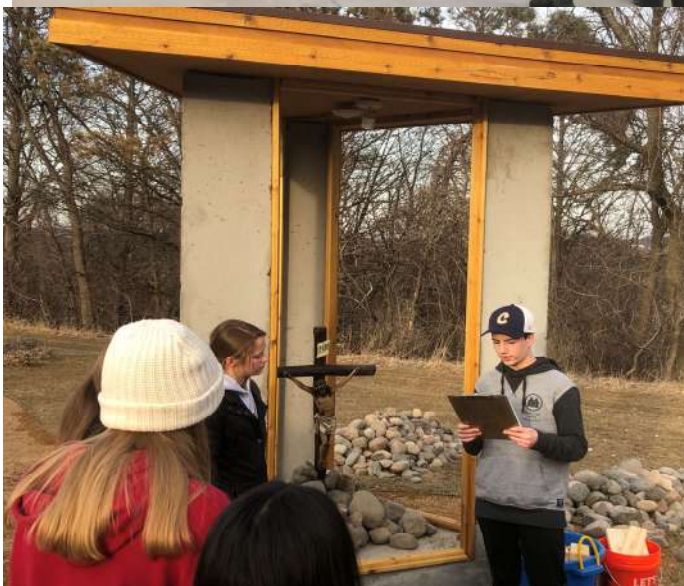
St. Victoria Youth visited the St. Nicholas Prayer Garden