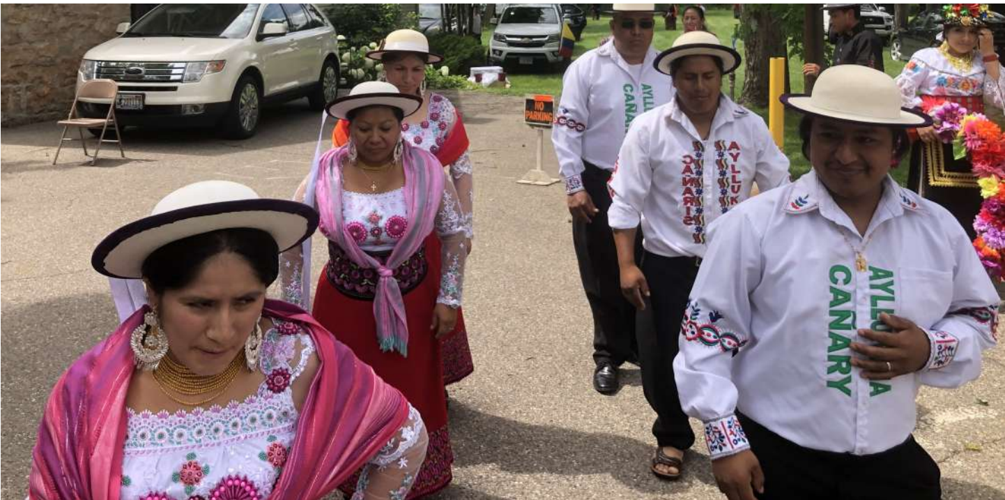
Domingo, 21 de Julio