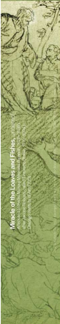
Miracle of the Loaves and Fishes, undated Attributed to Raphael, Moravia, Mantegna (Spanish, 1428-1489), after Jacopo Robusti, called Titian (Italian, 1477-1576) - 1564 Chicago Institute of Art (CICG)

Eighteenth Sunday in Ordinary Time August 2, 2020