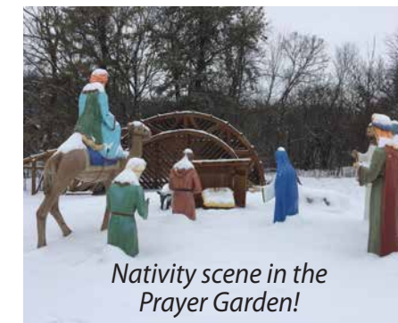
Nativity scene in the Prayer Garden!

We are glad to have you here today! If you wish to register at St. Nicholas, please call the church.