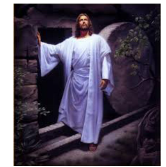
He is Risen!

412 W. 4th Street • P.O. Box 133 Carver, MN 55315 952-448-2345 952-368-0502 Fax www.stnicholascarver.org