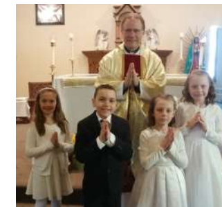
Congratulations to our 1st Communion Students!

412 W. 4th Street • P.O. Box 133 Carver, MN 55315 952-448-2345 952-368-0502 Fax www.stnicholascarver.org