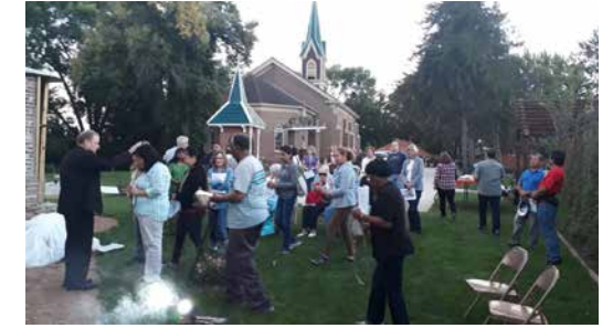
Thanks to all who attended the Our Lady of Good Health Novena!

412 W. 4th Street • P.O. Box 133 Carver, MN 55315 952-448-2345 952-368-0502 Fax www.stnicholascarver.org